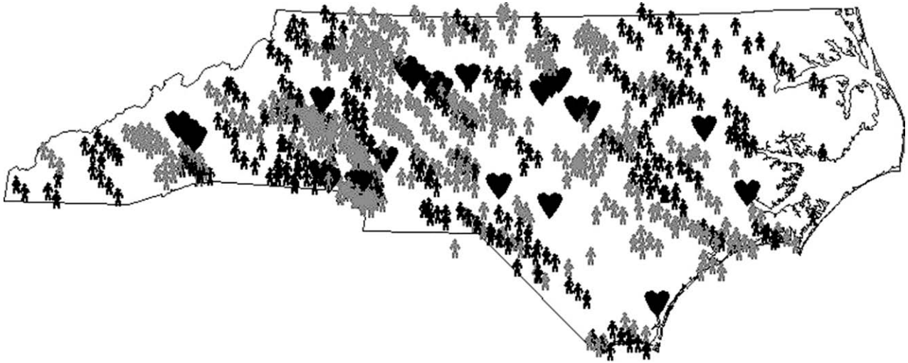
Figure 2. Map of North Carolina displaying types of transport and center capabilities. A gray man symbolizes a patient who was transported by EMS directly to a PCI-capable center. A black man symbolizes a patient who was transported to the nearest hospital (non-PCI center), and a heart identifies PCI centers. EMS indicates emergency medical services; and PCI, percutaneous intervention.

more patients were treated with fibrinolysis in the group that was first brought to a non-PCI facility. All patients eventually were taken to a PCI center, yet 35% of those first brought to a